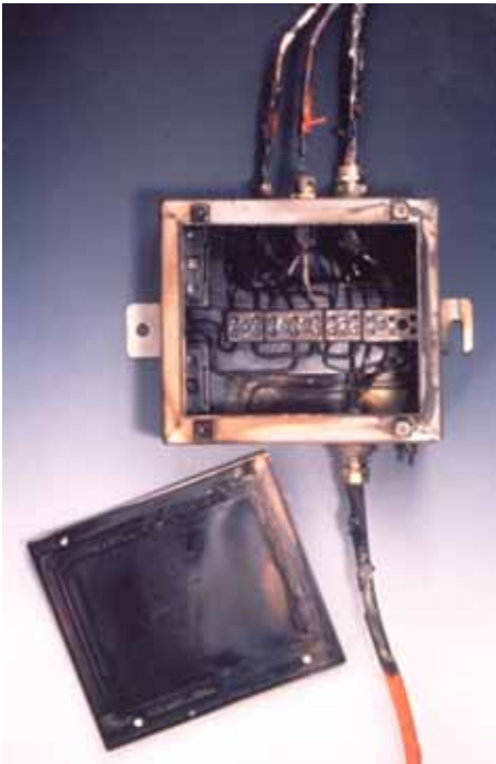
SX Range Enclosure and Cables after IEC331 Fire Testing