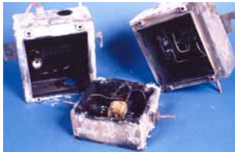
SX and BPG Range Enclosures after BS6387 Testing