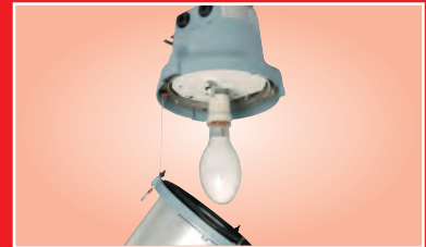
Glass retaining mechanism