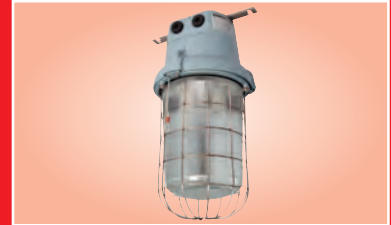
VL14 with wire guard