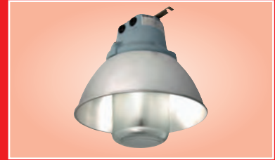
VL14 with external reflector