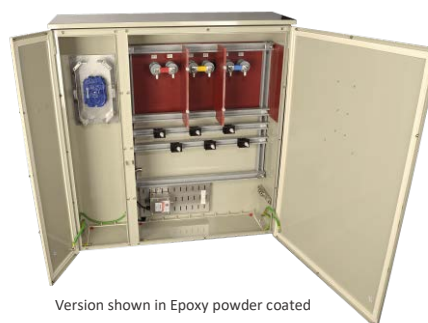
Version shown in Epoxy powder coated