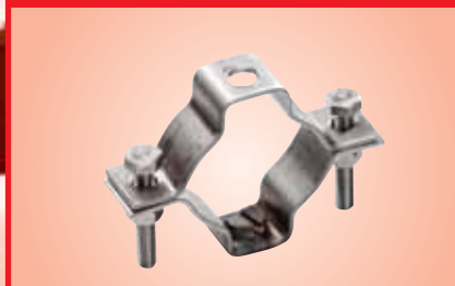
SEXCE-00002 (35-40mm dia) SEXCE-00003 (40-50mm dia)