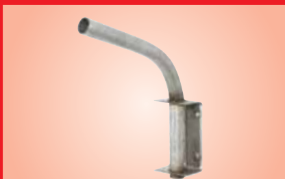
NPRO4-0007 (for use with /SE version) NPRO4-0008 (for std. 18W version) NPRO4-0012 (for std. 36W version)