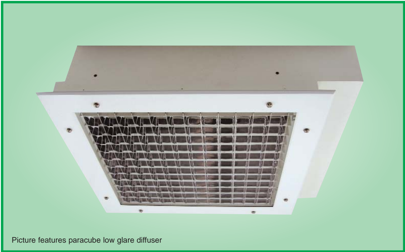
Picture features paracube low glare diffuser