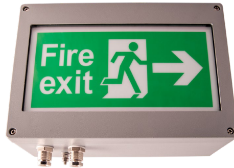
Image shown features running man with arrow suffix